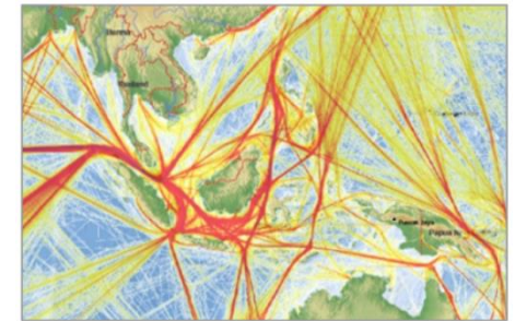
Growth of logistics