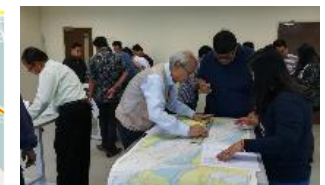
Training Image (AtoN Simulation)